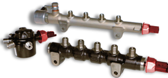
Fuel pressure sensors on the rail (highlighted in red)