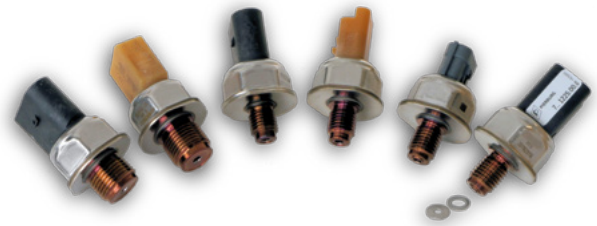
Fuel pressure sensors